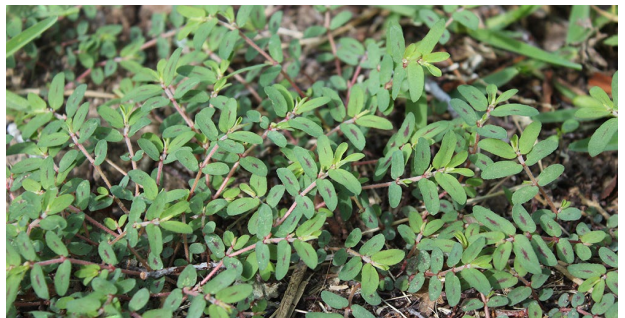
Spotted Spurge Chamaesyce maculate L.