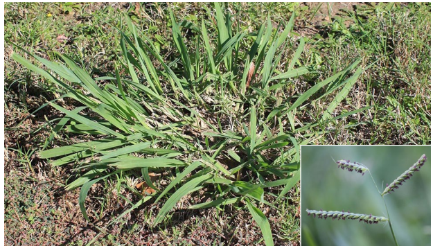
Dallisgrass Paspalum dilatatum