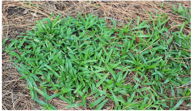
Doveweed Murdannia nudiflora (L.) Brenan