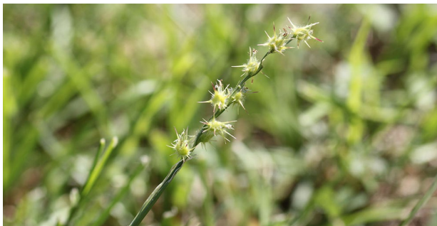
Sandbur Cenchrus spp.