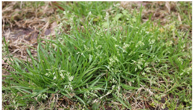
Annual Bluegrass Poa annua